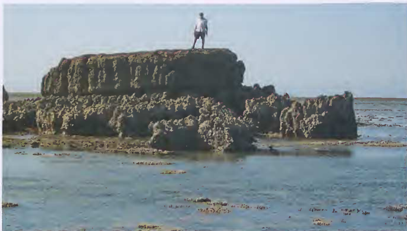
Figure 9. A massive dolomite stack on the mid-littoral reef flat near the south-eastern margin of Montgomery Reef ( 15^{\circ}55.221'S ; 124^{\circ}18.795'E ). Etched rocks on the lower part ( i.e. below high tide level). Also visible as a cluster of small dots on Figure 8.